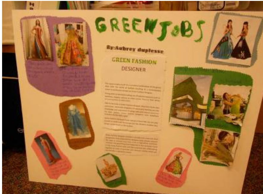
Fashion Designer: Helping the environment through organic fabrics.