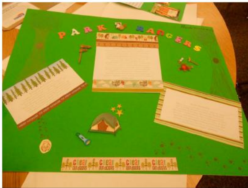
Park Ranger: Helping the environment through conservation.